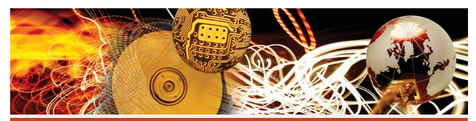
The Quarterly Newsletter of Firsthand Technology Value Fund, Inc.